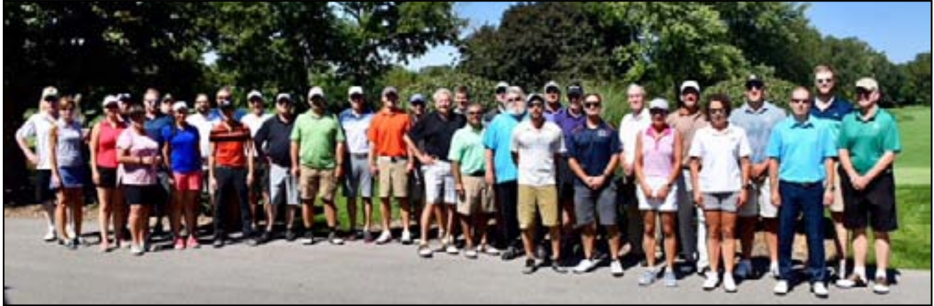
Team everybody, ready for a great day of golf.